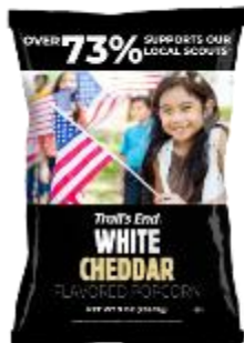
$20 White Cheddar Popcorn