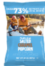
$25 Salted Caramel Popcorn