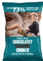
$30 Chocolatey Caramel Crunch