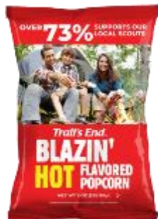
$20 Blazin' Hot Popcorn