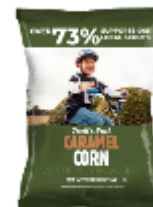
$10 Caramel Corn

Customers pay shipping: $7.99 plus $.99 per additional item (bundles of 2 are $8.98; bundles of 3 are $9.97). Products & pricing subject to availability and change.