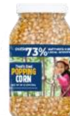
$15 Popping Corn Jar