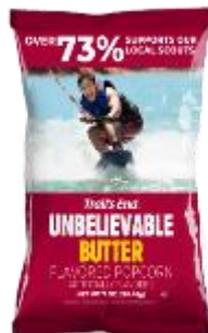
$15 Unbelievable Butter Popcorn