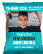
$30 Dark Chocolate Salted Caramels