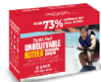
$25 Unbelievable Butter 12pk