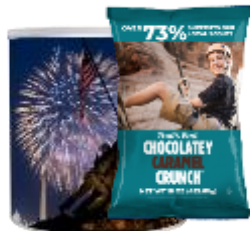
$35 Chocolatey Caramel Crunch Tin